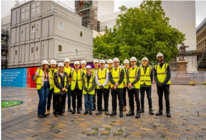
The 2022 PlanBEE Apprenticeship scheme cohort on their first visit to the Our Town Hall Project

Since the launch of PlanBEE in 2021 the project has supported 2 cohorts and with a 3 rd cohort due to commence in September 23. The success of the scheme has seen employees from other major construction projects in the city join the scheme, securing its long-term sustainability and creating more opportunities for residents.